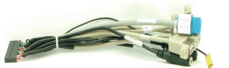
30-Pin Multi I/O(4xUSB, GBLAN, Audio) (10") 100-9641